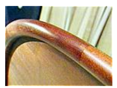
The dark finish warms

Exposed-spline joinery is used to hold the framemembers together, creating the curved form.